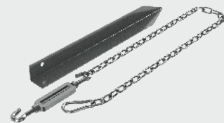
Chain & Spike Brace Kit